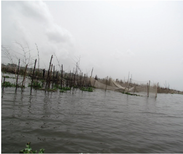
Figure 3: Harvesting an acadja.

The article is organized as follows. Section 2 presents the sampling framework, survey design, instructions for surveyors and processing of collected information. Section 3 reports on findings of the survey by subject: general information and rules, ownership, rules on sharing water resources and constraints. Section 4 synthesizes the findings and concludes.