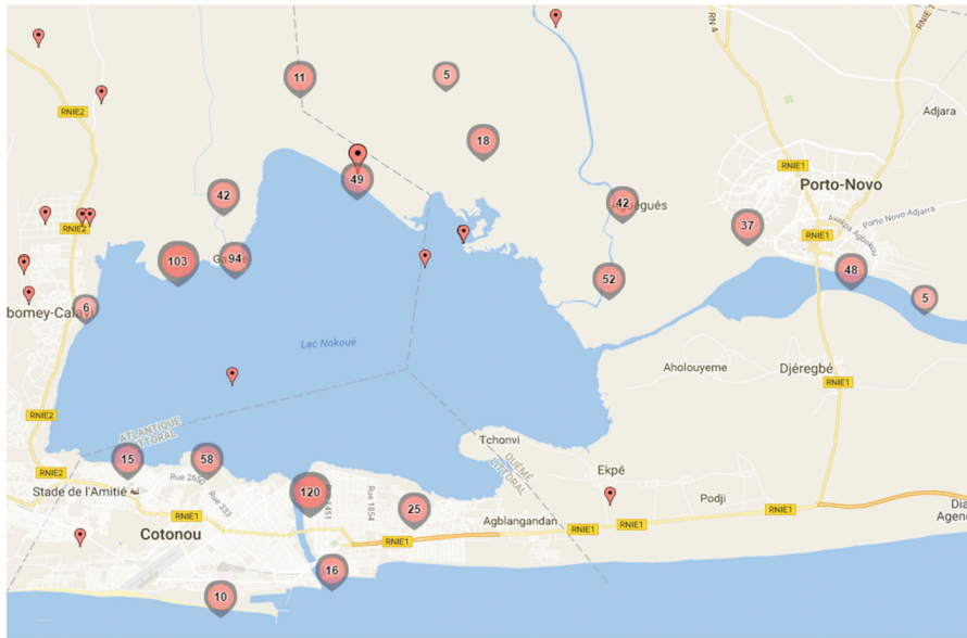
Figure 4: Mapping survey frequencies.

fishers and how to deal with controversial answers. A storyline was written to introduce the purpose of the survey and to indicate how the collected answers would be used to propose future policy measures to be discussed with a broad group of stakeholders with the fishers' active participation.